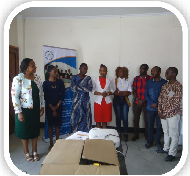
Program alumni posing with the program manager