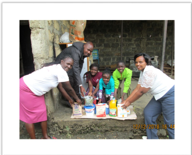
Maisha Bora program manager makes food donations to the family of one of the program beneficiary